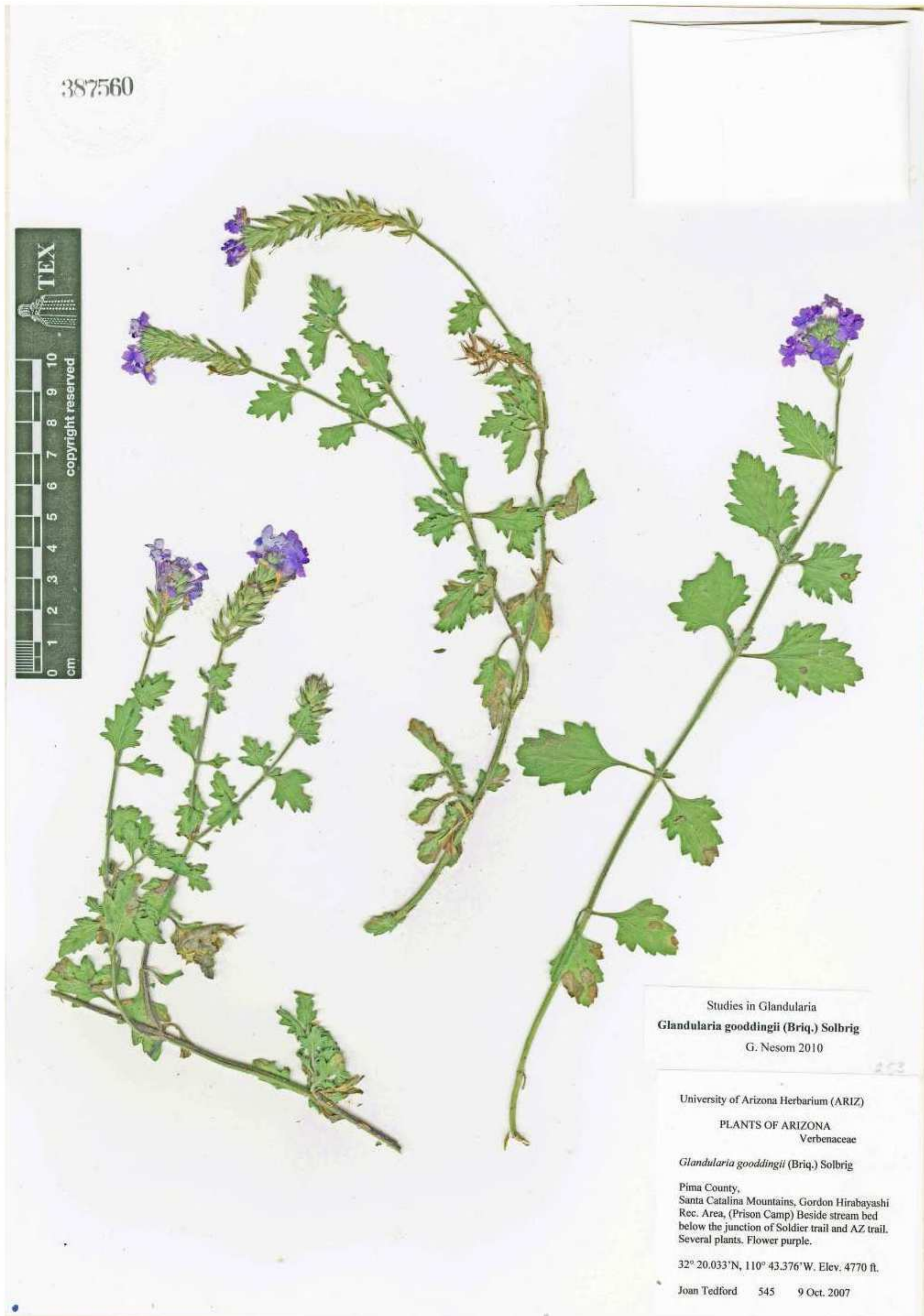
Figure 2. Glandularia gooddingii , leaves coarsely toothed.